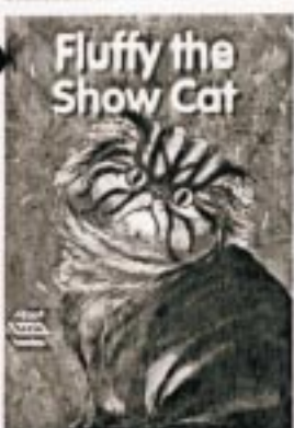
Fluffy the Show Cat is the first Flashbook Reader . It builds upon the Cats Flashbook with an interactive story for reading to young children.