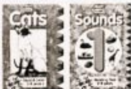
Flashbooks (at left) present young children with uncluttered, accurate, unmistakable colour pictures from real life, and interesting information about what they are seeing.

"Well done. The work you have done is inspired."